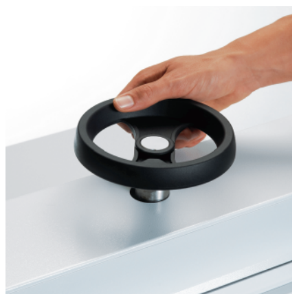
SPINDLE CLAMP WITH HAND WHEEL The hand wheel is used to apply even clamping pressure along the entire cutting width.