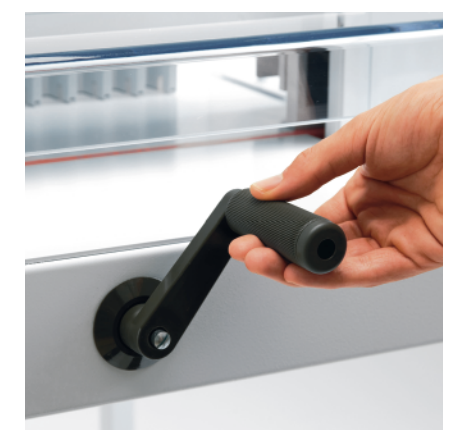
HAND CRANK The calibrated hand crank and front table measurement scale ensure precise back gauge positioning.