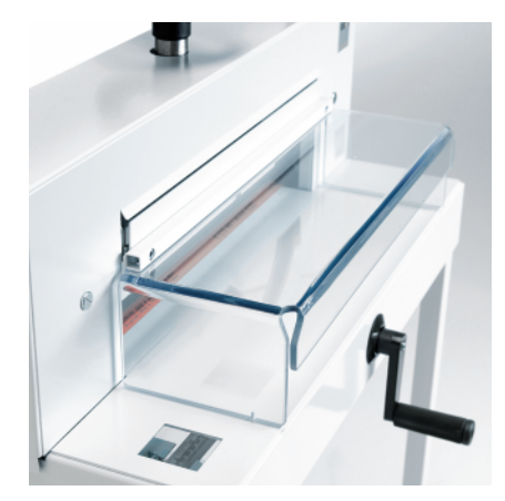
TRANSPARENT SAFETY GUARD A cut can only be executed if the hinged safety guard is in the closed position and the blade safety catch is released.